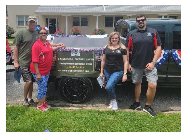
USK at Harve de Grace Parade

I hope that you each have received, reviewed, and shared my School of Instruction materials on our Department President's Special Project – U.S. Kennels. I hope that you have not only shared this information within your own Auxililaires but also with your Post and within your communities as well.